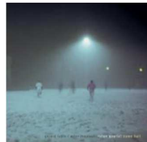
Foton Quartet - Zomo Hall